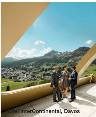
Hotel InterContinental, Davos